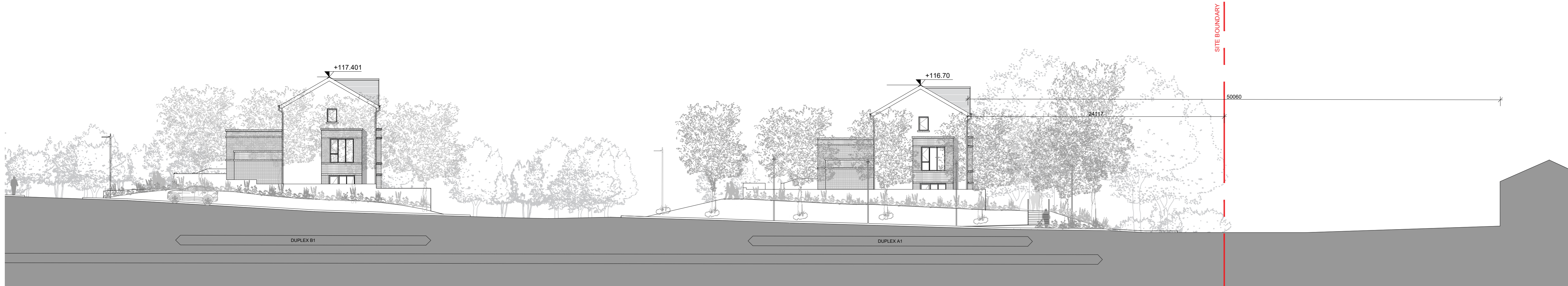
4 PROPOSED CONTIGUOUS ELEVATION 2-2 (Part B) SCALE: 1:200