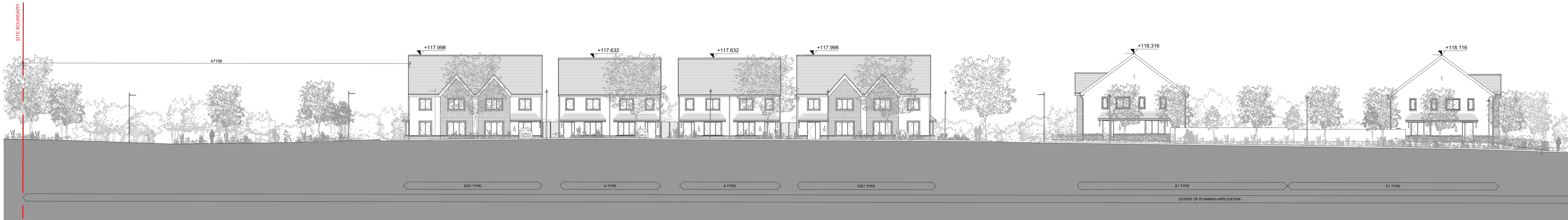
3 PROPOSED CONTIGUOUS ELEVATION 2-2 (Part A) SCALE: 1:200